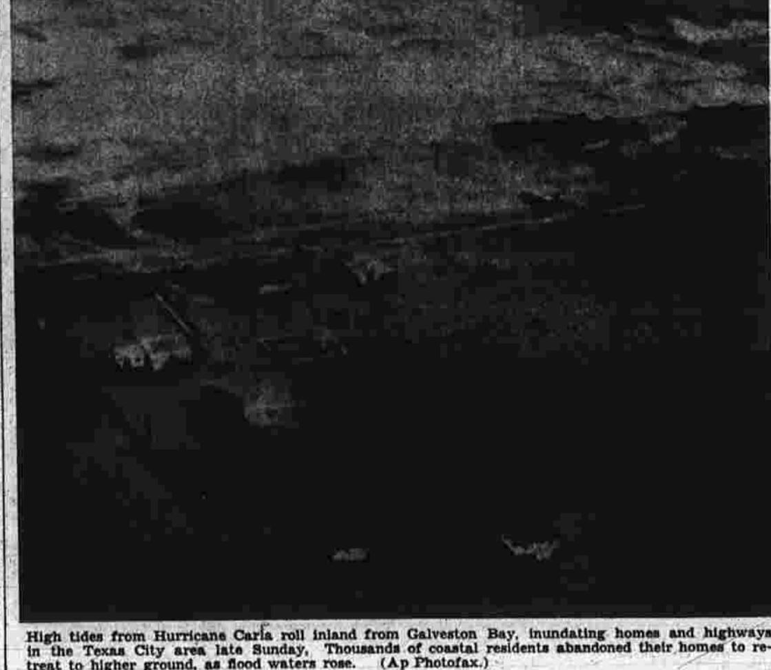
High tides from Hurricane Carla roll inland from Galveston Bay, inundating homes and highways in the Texas City area late Sunday. Thousands of coastal residents abandoned their homes to retreat to higher ground, as flood waters rose.